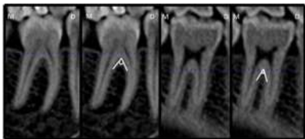
Figure 1. Angle of roots was measured sagittal CB-CT images at selected mandibular first molar teeth. Angle of roots is the angle between the line drawn from the highest crown point of the furcation entrance to the furthest mesial curvature point of the mesial root and the line drawn at the highest crown point of the furcation entrance to the furthest mesial curvature point of the mesial root at a sagittal CB-CT images view where the angle of roots mesial and the distal root is the widest. M, Mesial; D, Distal.

RA was measured sagittal CB-CT images at selected mandibular first molars. RA is the angle between the line drawn from the highest crown point of the furcation entrance to the furthest mesial curvature point of the mesial root, and the line drawn at the highest crown point of the furcation entrance to the furthest mesial curvature point of the mesial root at a sagittal CB-CT images where the RA mesial and the distal root is the widest (Figure 1).