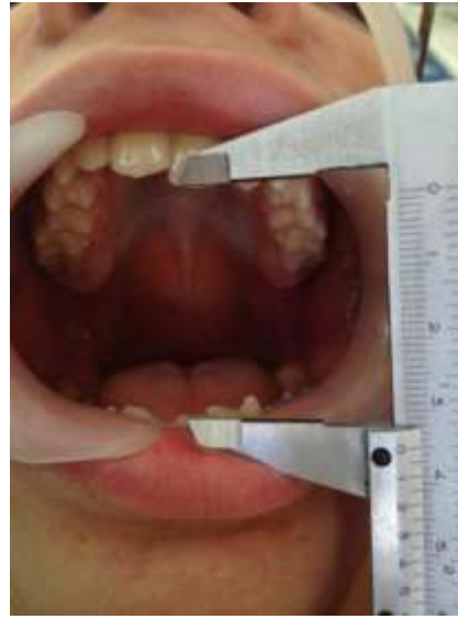
Figure 8. Postoperative maximum mouth opening