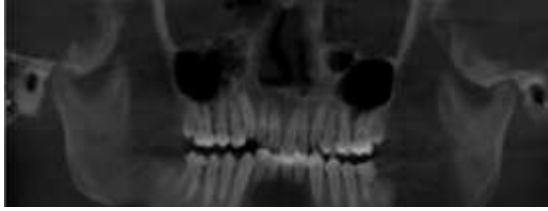
Figure 4. Panoramic view of CT scan.