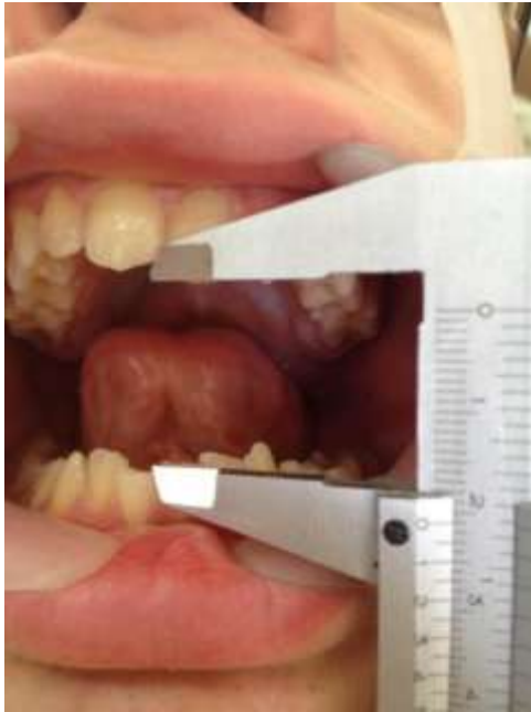
Figure 1. Preoperative maximum mouth opening.

On physical examination, there was no evidence of facial asymmetry. The maximum mouth opening was calculated as only 21 mm (Figure-1). Left and right excursions of mandible were also limited and mandible presented no protrusive movement. The patient had a retrognathic mandible in cephalographic examination and his occlusion was Class II according to Angle Classification (Figure-2). On initial examination, this case was evaluated as a temporomandibular joint (TMJ) disorder. He had no pain or tenderness over TMJs and masticator muscles. The attempt to open his mouth by stretching TMJ under deep sedation was unsuccessful. Magnetic resonans imaging (MRI) and computed tomography (CT) scans were obtained to analyse TMJ. No disc dislocation or sign of other internal derangements were observed on MRI scan. On the CT scans, there was no evidence of bony or fibrous ankylosis of the TMJ. The previous panoramic radiograph was examined again and bilateral elongation of coronoid processes was noticed (Figure-3). 3D-CT scans were taken to confirm the diagnosis (Figure-4,5,6).