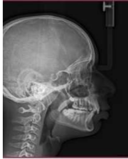
Figure 2. Cephalometric radiography