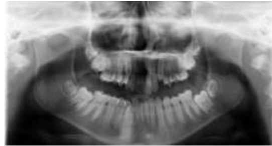
Figure 3. Preoperative panoramic radiography.

The patient underwent bilateral coronoidectomies under general anesthesia. He was taken to the operating room and anesthesia was induced following a nasotracheal intubation. Incision was made on the anterior aspect of ascending ramus and extended anteriorly to the second molar. Ascending ramus was exposed up to the top of the coronoid process. The temporalis muscle was then detached from the coronoid process, and a horizontal osteotomy was made with a Lindemann drill from the sigmoid notch to the anterior border of the ascending ramus. The coronoid process was excised. After right coronoidectomy was completed, the maximum mouth opening was 28 mm. The same procedure was performed on the left side afterwards. At the end of the operation the interincisal distance was 31 mm. Postoperatively the patient was examined by panoramic radiography (Figure-7). From the fifth postoperative day, the patient underwent physiotherapy using tongue blades 3 times a week for