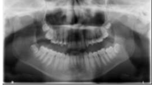
Figure 7. Postoperative panoramic radiography.

three months. Follow up with mobilization exercises for 11 months postoperatively revealed an interincisal opening of 36 mm with 4mm and 5 mm left and right excursion, respectively without pain or lateral deviation (Figure-8). Protrusive movement was observed nearly 3 mm. Also mastication and phonation of the patient were improved.