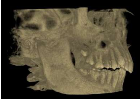
Figure 5. 3D-CT scan of right side.